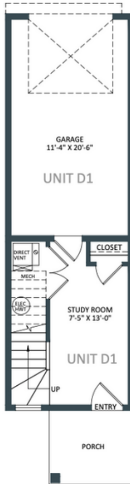
SECOND/MAIN Main Floor Area: 898 sq.ft.